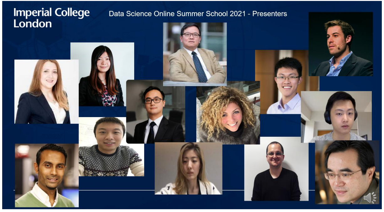
Photo above: Data Science Online Summer School 2021 Teaching Faculty