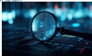
Operations Research (MSOR)