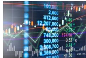
Financial Engineering (MSEE)