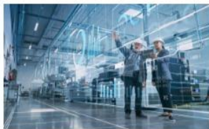
Industrial Engineering (MSIE)