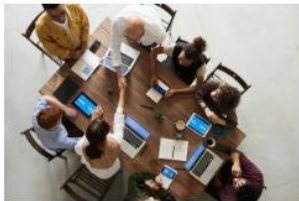
Management Science and Engineering (MS&E)