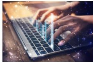
Business Analytics (MSBA)